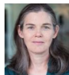
Daphne Koller, PhD Stanford University, USA